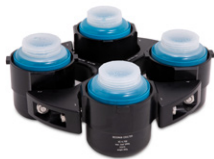
VS 4.750 BIOC

4 x 750 mL Swinging-Bucket Rotor with several configurations. Easily exchange buckets for microplate carriers or hexagonal carriers.