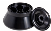
VF 6.250 BIOC

6 x 94 mL tube rotor with Biosafe lid Max speed: 11,872 x g (10,000 rpm)