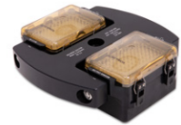
VS 2.5-96 BIOC

4 x 25 x 10 mL hexagonal bucket rotor Max speed 240V / 120V: 4,478 x g (4,700 rpm) / 3,748 x g (4,300 rpm)