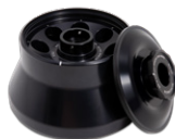
VFC 8.50 BIOC

24 x 15 mL conical tubes Max speed: 11,431 x g (9,000 rpm)