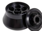
VF 6.94 BIOC

8 x 50 mL conical tube rotor with BioSafe Lid Max speed: 15,032 x g (11,360 rpm)